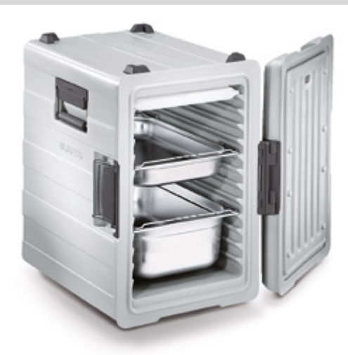
B.PROTHERM 620 KUF (with accessories) unheated, with eutectic plate at top for extra-long cooling, hinged door can be swivelled by 270° and removed.

For longer-lasting transport or storage periods, the eutectic plate (accessory, page 21) also ensures optimum cooling.