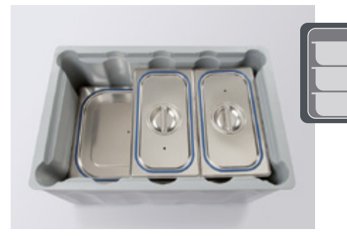
Can be loaded in stacks. For maximum capacity, the GN containers can be stacked next to and on top of each other in various heights and sizes in the B.PROTHERM 320 ECO-C.

For maximum flexibility when providing decentralised supply with various menu components.