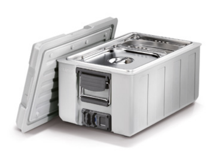
BPT 320 KB (with accessories). Thanks to their integrated stainless-steel inlet, B.PROTHERM Ks with silicone heating can be directly loaded with food – without extra Gastronorm containers.