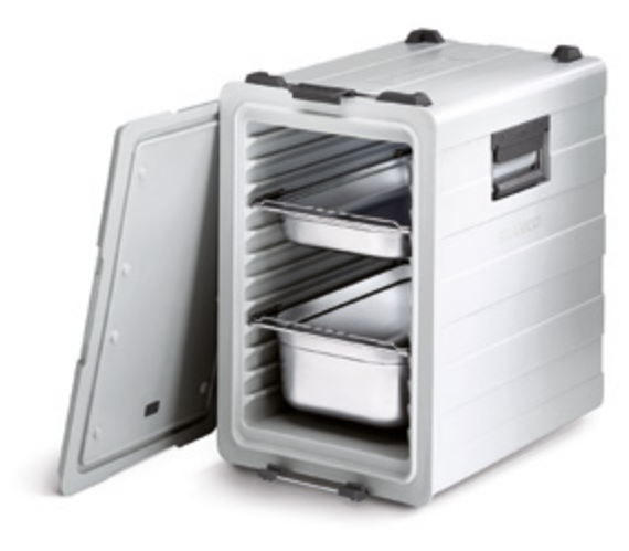
B.PROTHERM 620 KV (with accessories) unheated, with removable door