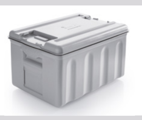
B.PROTHERM 320 ECO

The basic model: unheated with a lid that sits securely (not clamped), easy to open